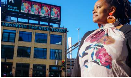
Above: Celtic Thunder Christmas Below: "Starlight/Stardust/Star" by Eyenga Bokamba, from Black History Month billboard exhibit